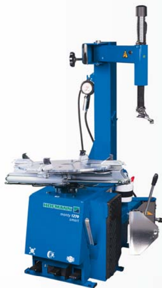
Table-top tyre changers with single speed