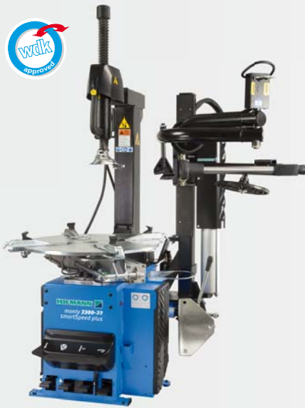
Table-top tyre changers with smartSpeed technology