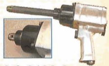
SK9136 & 9136-6