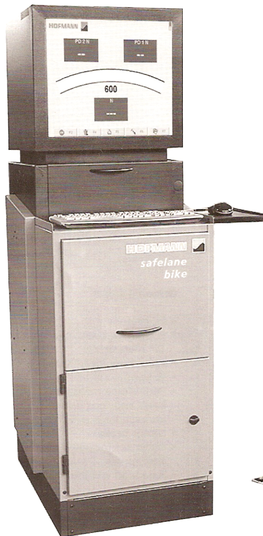
Optional PC cabinet

Modular brake tester for motorcycles and motor-scooters