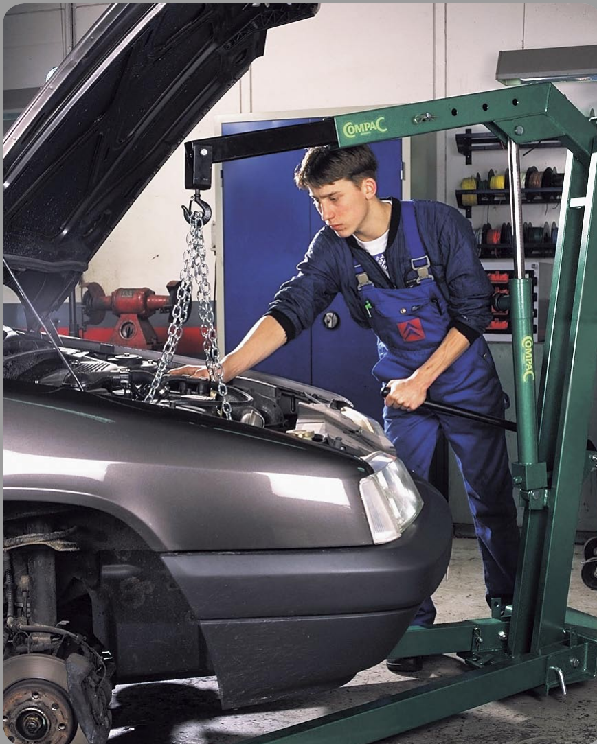
Swivel pump handle position enables operation by just one mechanic.