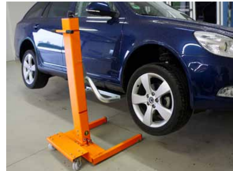
an adapter under a threshold beam

The delivery of EASYLift 1500 includes an adapter under the wheel (plug) and an adapter under a threshold beam (plate)