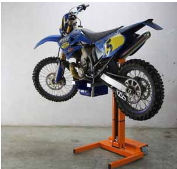
EASYLift 1500 is also suitable to service sport motorcycles using „MOTO“ adapter.