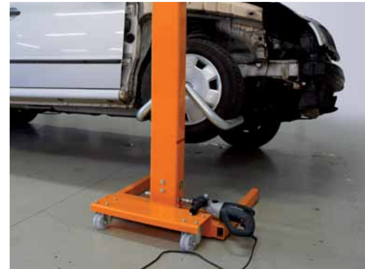
under a wheel adapter