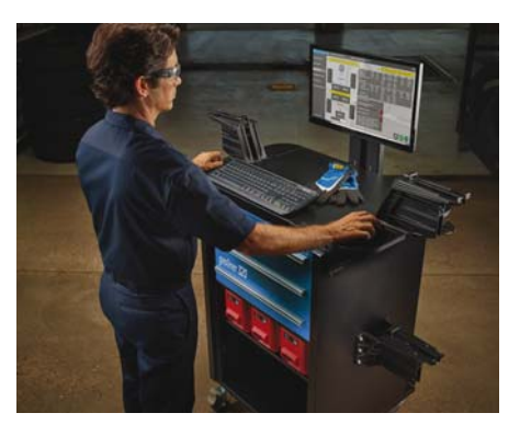
Attractive toolbox styling, featuring easyrolling casters, storage for all attachments and a fully enclosed printer compartment.