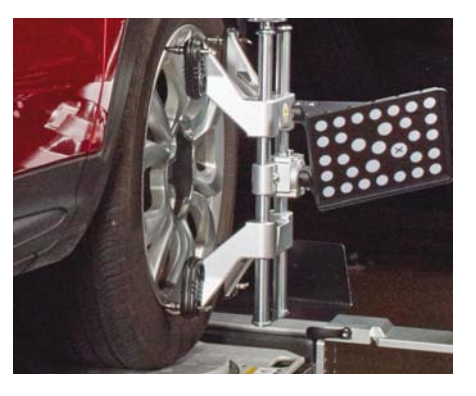
Cast aluminum AC700 wheel clamps fit rims from 11" to 22," with no limitations and 4,9 to 5,2 kg (10.9 to 11.5 lbs.) per clamp.