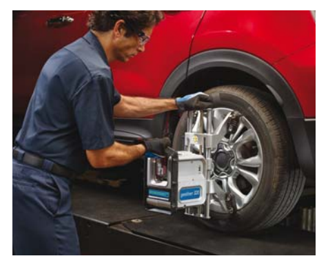
Pods mount with ease, communicating wirelessly and store quickly and easily when finished.